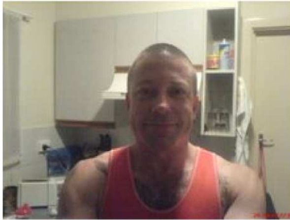
One week after diagnosis and three weeks before the operation – No Fear!

I would gladly trade in all my money (which isn't much now) and every single material possession I have for the chance to have my brain function restored. I was foolish! Please don't make the same mistake. Your brain is much more precious than the device called a cell phone. If you don't believe this after reading this completely then there is no hope for you, and you will find out the hard way just like I have. Remember one thing, when you get a brain tumor from cell -phone use and you nearly die as a result, ring up the cell -phone shop and you will see how quickly they hang up on you. All the smiles you remember in the shop going through all the models with the sales people are gone and now you are totally alone in a world of pain, torment, and humiliation.