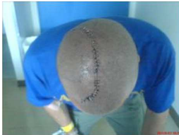
Overhead View: Two days after the operation.

I spent approximately $4000 AUS dollars on my cell -phone bills in 1996. I still can't believe that I gave those Criminals all that money and I don't expect that they will ever pay me back any of it either.