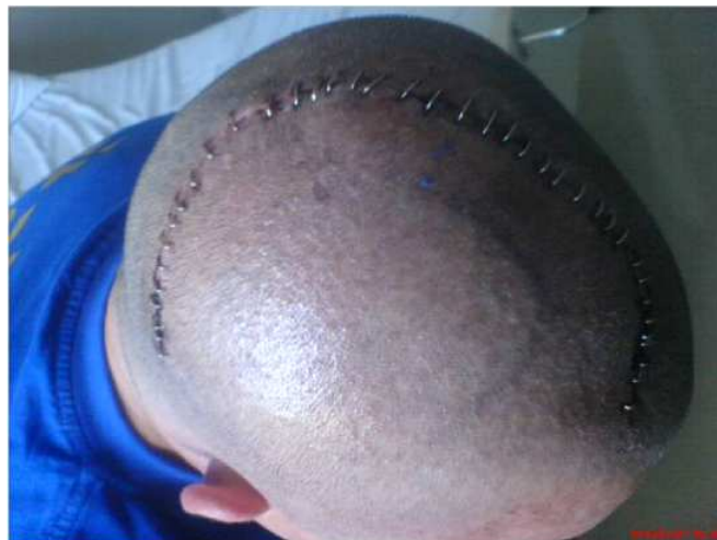
Two days after the operation. (You can see where the skull was opened as it is raised slightly opposite the staples. The blue arrow points to the hole in my head.)

I would gladly trade in all my money (which isn't much now) and every single material possession I have for the chance to have my brain function restored. I was foolish! Please don't make the same mistake. Your brain is much more precious than the device called a cell phone. If you don't believe this after reading this completely then there is no hope for you, and you will find out the hard way just like I have. Remember one thing, when you get a brain tumor from cell -phone use and you nearly die as a result, ring up the cell -phone shop and you will see how quickly they hang up on you. All the smiles you remember in the shop going through all the models with the sales people are gone and now you are totally alone in a world of pain, torment, and humiliation.